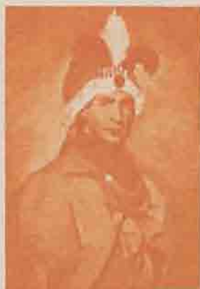
PIRATE CAPTAIN BILLY BOWLEGS

The Billy Bowlegs Festival has William Augustus Bowles, a notorious old boy, as its patron pirate. He arrived in what was to become Florida's Playground Area in 1778 when the Spanish, English and Americans were maneuvering for control of the Gulf shores and its shipping lanes. Believing himself destined to command instead of obeying, Captain Billy Bowlegs gathered a force of a "couple hundred plundering Indians, relics from the American Army and White Banditti", a rollicking piratical crew which grew to be the concern of all three of the power-hungry countries. Captain Bowlegs (Bowles) created his own throne and the three nations considered everything from murder to a general's commission to get him on the right side. Financed by loot from a Spanish ship and surrounded by a handful of Indians, Captain Billy invaded English society for support. He was rewarded with a flag of 'English and Indian colors mixed', a silver pipe, tomahawk, a Chain of Friendship and trade supplies, with which he formed the State of Muskogee. The Spanish enticed him to New Orleans and grabbed the head of the State of Muskogee. He was shipped out to Madrid and then to the Philippines, but he jumped ship and returned to his 'state' and greater deeds of piracy. He raided on the Gulf and on shore. His schooners flew his pirate flag, except when they switched to the British Flag to claim their 'salvaged' loot at international ports.