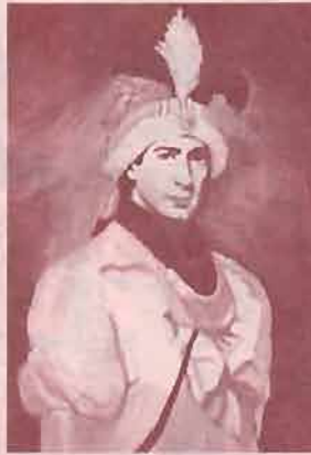
PIRATE CAPTAIN BILLY BOWLEGS

The BILLY BOWLEGS' FESTIVAL has William Augustus Bowles, a notorious old boy, as its patron pirate. He arrived in what was to become Florida's Playground Area in 1778 when the Spanish, English and Americans were maneuvering for control of the Gulf shores and its shipping lanes. Believing himself destined to command instead of obeying, Captain Billy Bowlegs gathered a force of a "couple hundred plundering Indians, relics from the American Army and white banditti"...a rollicking piratical crew which grew to be the concern of all three of the power-hungry countries. Captain Bowlegs (Bowles) created his own throne and the three nations considered everything from murder to a general's commission to get him on the right side. Financed by loot from a Spanish ship and surrounded by a handful of Indians, Captain Billy invaded English society for support. He was rewarded with a flag of "English and Indian colors mixed", a silver pipe, a tomahawk, a chain of friendship and trade supplies with which, he formed the State of Muskogee. The Spanish enticed him to New Orleans and there grabbed the new head of state. He was then shipped out to Madrid, Spain and then to the Philippines, but he jumped ship and returned to his "state" and greater deeds of piracy. He raided on the Gulf and on its shores. His schooners flew his pirate flag except when they switched to the British flag to claim their "slavaged" loot at international ports.