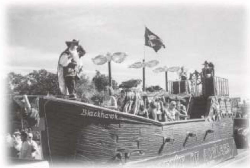
The Blackhawk on Parade