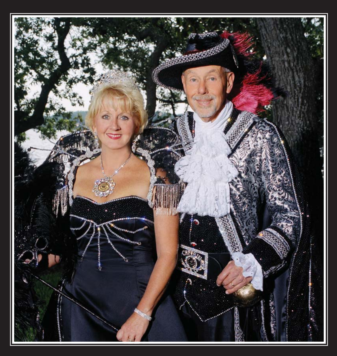
JUNE 10, 2006