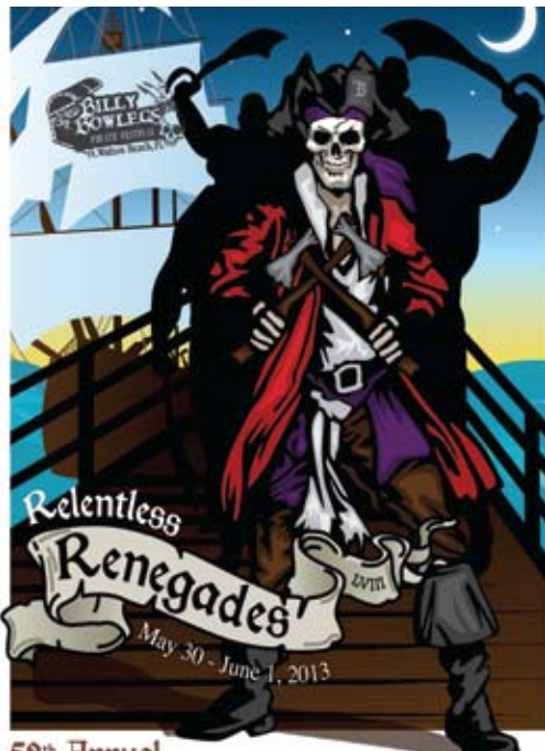
58 th Annual Billy Bowlegs Pirate Festival

The Krewe of Bowlegs, in partnership with the Greater Fort Walton Beach Chamber of Commerce and the city of Fort Walton Beach, every year plan and execute a highly popular event. The